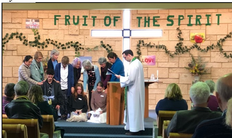
Laying of hands by Elders for Confirmation