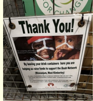
Some of the many “Containers for Change collection points

Containers for Change, WA's container deposit scheme, began October 2020 with All Saints Floreat UC making it first deposit soon after on 9 October. Since then, many collection points have been set up by partner Uniting Churches and individuals across the metropolitan area. By 8 January 2025 $15,000 had been raised for the Floreat UC Creative Living Centre's work assisting indigenous peoples in the Kimberley and West Papua, Indonesia.