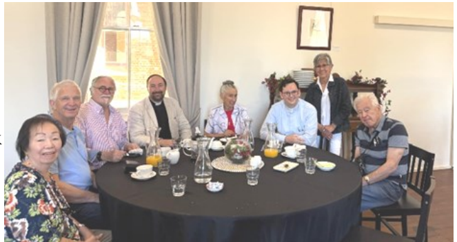
Half of our group after finishing lunch.

We learned about the monastery and of the six monks who still live in it. We walked through their magnificent church, admired the