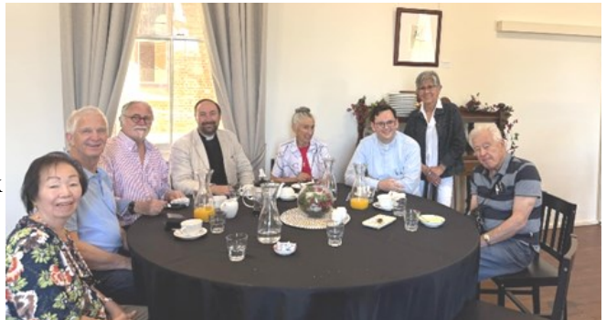
Half of our group after finishing lunch.

We learned about the monastery and of the six monks who still live in it. We walked through their magnificent church, admired the