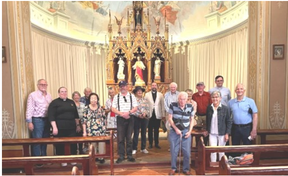
Our New Norcia group in the chapel of St Gertrudes

Russell and I enjoyed the sights of driving up along the way. While our