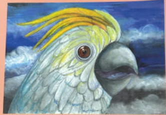
Clive the Kimberley cockatoo