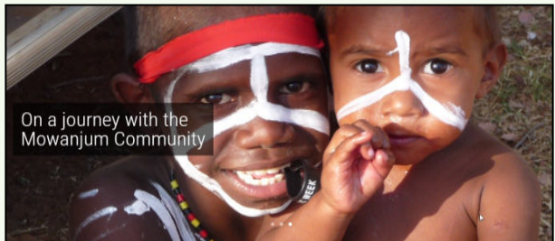
On a journey with the Mowanjum Community

Your Retiring Offering this Week and throughout April will be for the BOAB Network